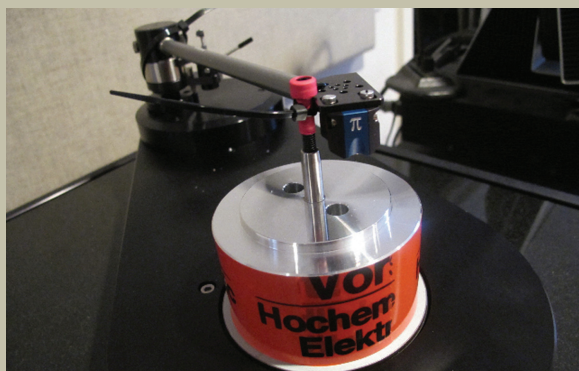
Brinkmann's 9.6 tonearm and Pi cartridge.

But don't even think about it. In short, what the 9.6 lacks in bells and whistles it made up for in the excellence of its machining and construction. The 9.6 tonearm is a very well made, basic design, but at $3990 it faces some stiff competition for not that much more money—competition that offers greater functionality, perhaps with greater dynamic capabilities and more precise extraction of information from the grooves.